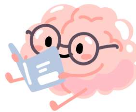
Training for First Responders & Community Helpers