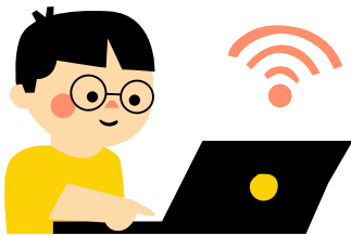
Online Resource Toolkits