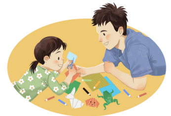
Comfort Bags for Kids