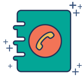
Grief Support Services Directory